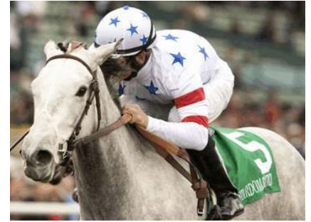
Stardom Bound