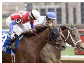
Swift Temper (outside)

Swift Temper pulled off a 21-1 upset in the GIII Gardenia H. at Ellis Park last August before finishing third in the GII Chilukki S. at Churchill Nov. 2, and closed out 2008 with a fourth in the GII Falls City H. at the Louisville oval Nov. 27. After an eighth-place effort to start the year in a seven-furlong optional claimer at Gulfstream Jan. 17, the chestnut completed the exacta behind One Caroline (Unbridled's Song) in the GII Sabin H. at the same track Feb. 20 last out. The second choice broke smoothly and showed the way into the backstretch through a :48.90 half. After turning back a bid from Quick Notice at the eighth pole, the five-year-old kept finding more to deny odds-on California shipper Santa Teresita to collect her second graded trophy. Click for the brisnet.com chart or the brisnet.com PPs . Video, sponsored by Taylor Made.